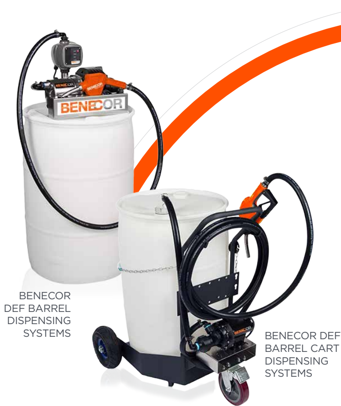
BENECOR DEF BARREL DISPENSING SYSTEMS