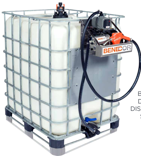
BENECOR DEF TOTE DISPENSING SYSTEMS